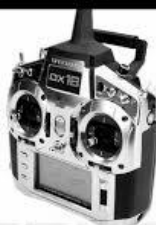
SPM180001 (mode 1)