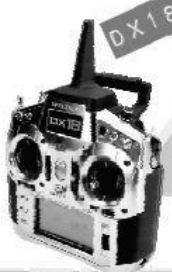
SPM180001 (mode 1)