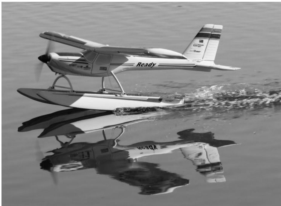
Grants Thunder Tiger "Ready"