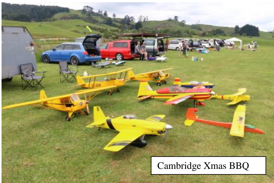
Cambridge Xmas BBQ