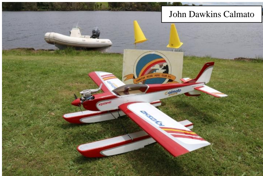
John Dawkins Calmato

After the usual “will we, won’t we” phone calls it was off to the lake to test the waters so to speak. Yep, the lake was quite calm but there was a foul offshore wind blowing. Hmm, strange the water is so calm until looking across to the other side of the lake where the wind was hitting it